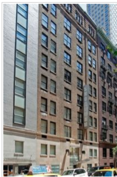
The Shoreham Hotel at 33 W. 55th St. will likely be renamed the Affinia Shoreham.